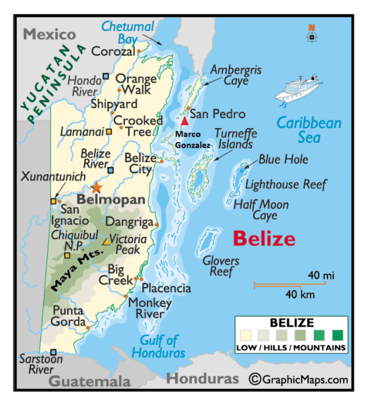
Figure 1: Map of Belize. The site of Marco Gonzalez is located at the south end of the island of Ambergris Caye, ca. 6 km south of San Pedro Town (Reproduced with permission of www.worldatlas.com).

'Marco Gonzalez' is the name of a Maya archaeological site on the southern tip of Ambergris Caye, a coral island that lies off the north coast of Belize and is bordered to the windward by a barrier reef ( Fig. 1 ). The site boasts a long history, but what first drew us to the slightly kidney-shaped mound, ca. 340 m by 160 m, were its dark soils and distinctive vegetation. The soils are sought by locals for their gardens, and the vegetation clearly stands out from the surrounding mangrove swamp. The local soil parent materials of Pleistocene reef limestones (James and Ginsburg 1979; Gischler and Hudson 2004) could not have been responsible naturally