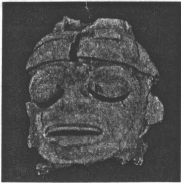
Fig. 2. Pottery figurine head, late Post-Classic

On my return to Lamanai, I found the clearing completed, and so put one crew on the newly-denuded structure, and another on a small building nearby, which I had decided to investigate at the same time. The smaller mound was named "Sac" for no particularly good reason; the larger is "Kambel". Looks like a Mayan word, does it not? I know what I risk in telling you the etymology of Kambel, but here goes: the structure is in mapping square P9; this is the first excavation in a "P" square; "P" suggested pea soup; Stan Loten asked me the Mayan word for soup; I didn't know, but espying a familiar red and white tin on a shelf near where we sat, I said "Kambel". Laughter ensued (that was my intention), but "Kambel"