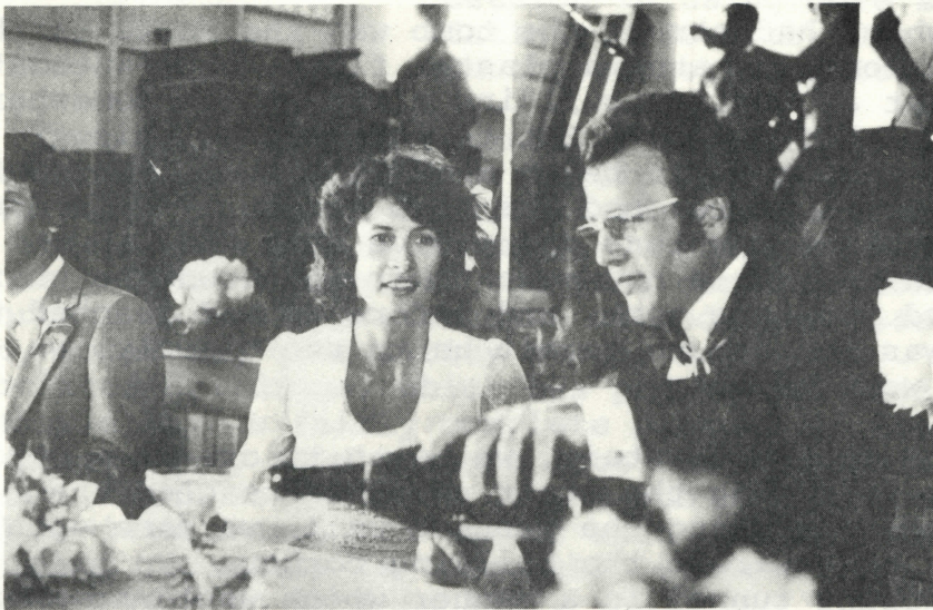
Fig. 1. March 10th: The rigours of life in the jungle sometimes beggar description.

A formidable thing, the logistics of an archaeological undertaking in the tropics. Trips in boats with motors that often break down must be scheduled so as to coincide with the arrivals of chartered planes at remote airstrips, the latter having been timed so as to connect with commercial flights which only occasionally arrive on schedule at the international airport. Beyond this, truck transport must be arranged so that the workmen can be